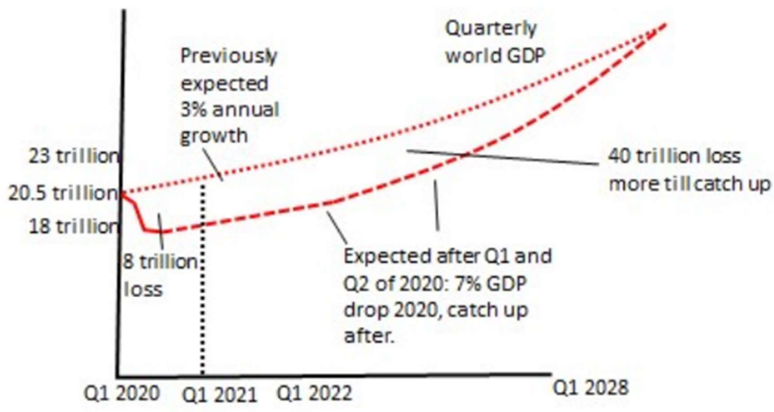
Previously projected GDP and later projected GDP: one-year loss versus cumulative loss